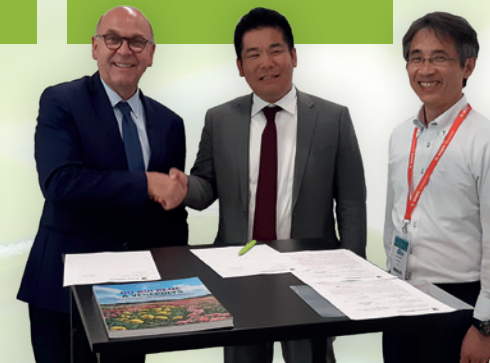
Signature of a MoU with Plant Laboratory and Tokyo University

VEGEPOLYS VALLEY is also involved with large EU' projects such as Smart AgriHubs and NATUREEF. All these components contribute to value our expertise and promote the French Know-how abroad.