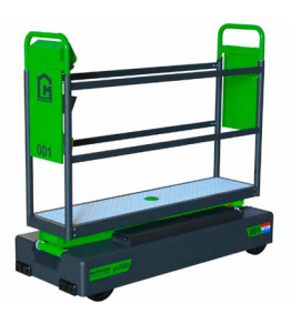
PIPE RAIL TROLLEY GL3500-D BV0000049

Many products are immediately available. Please contact us for the delivery time.