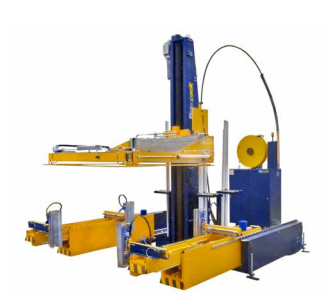
REISOPACK 2905 STRAPPING MACHINE VP0001099