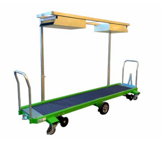
HARVEST TOMATOES TROLLEY GREENCART THC-L BV0000006