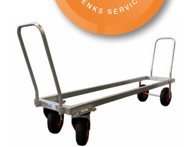
ALUMINIUM TRANSPORT TROLLEY AIR TIRES