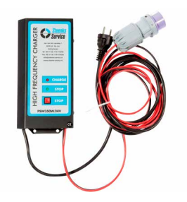
BATTERY CHARGER HIGH FREQUENCY AL0000030