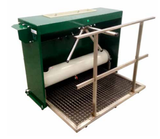
DESINFECTION GATE DIV0000101