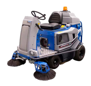
GROUND COVER FLOOR SWEEPER STEFIX 135 VE0000007