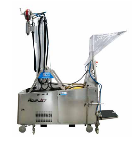
AQUAJET GREENHOUSE ROOF CLEANER