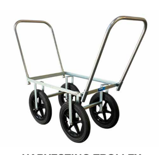
HARVESTING TROLLEY STEEL WITH SOLID WHEELS