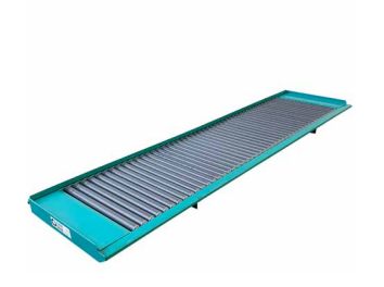
TOMATO ROLLER CONVEYOR

BP509 | Quantity: 3 pieces Rail size: 425-51 mm