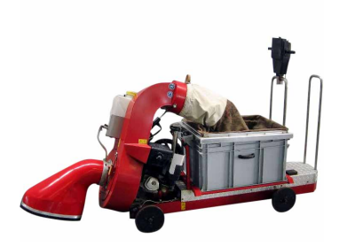
LEAF COLLECTOR HABL VERHAGEN

BR361 | Quantity: 2 pieces Rail size: 550-51 mm