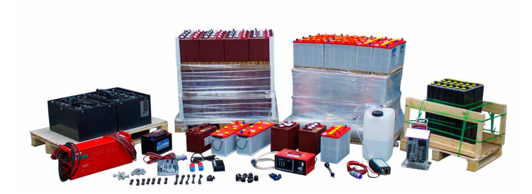
SEVERAL TYPES OF BATTERIES AND CHARGERS FOR DIFFERENT TYPES OF MACHINES AVAILABLE