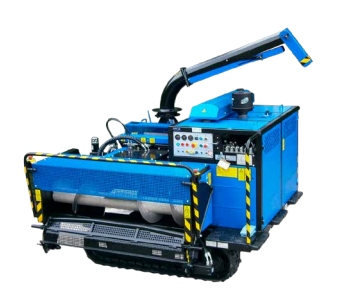
BIO CHOPPER COMPACT SHREDDER DIV0000104