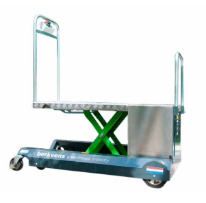
LEAF PICKING TROLLEY GREENCART LPC

Quality, Certainty, Service and Support.