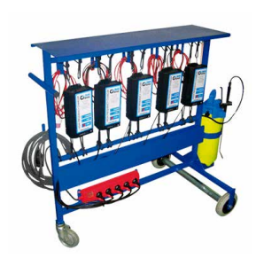
CHARGER STATION INC. CHARGER AL0000034