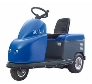
BULL 2 TOW TRACTOR TR0000108