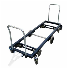
TRANSPORT TROLLEY STEEL 187 CM

BR365 | Quantity: 5 pieces Rail size: 425 or 550 mm