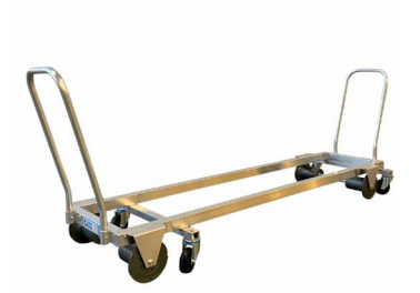
TRANSPORT TROLLEY ALUMINIUM 187 CM

BP575 | Quantity: 4 pieces Rail size: 550-51 mm