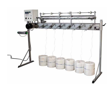
TOMATO HOOK WINDING MACHINE HW0000008