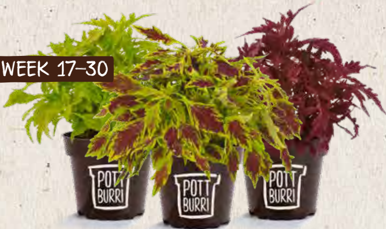
COLEOS-MIX „FLAME THROWER“