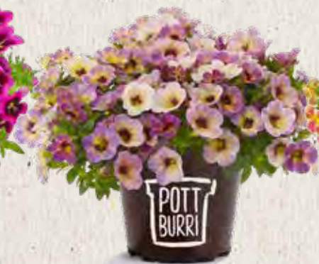
CALIBRACHOA „BLUEBERRY SCONE“