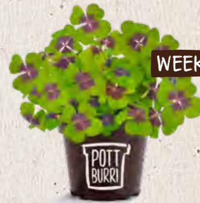
OXALIS „LUCKY CLOVER“