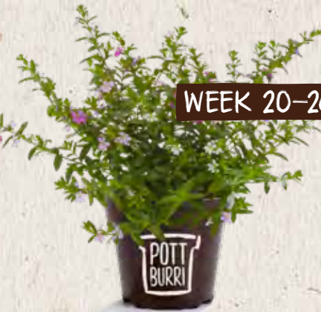
CUPHEA TRIO „FLORY GLORY“