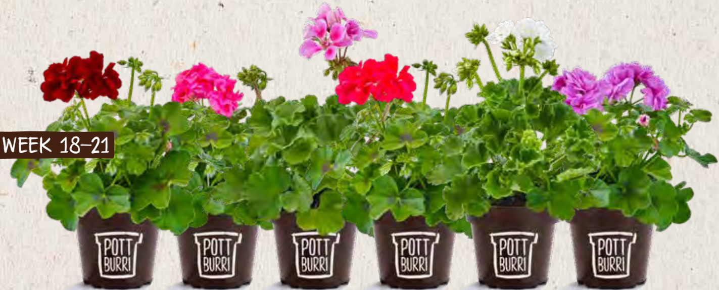
GERANIUMS IN SPECIAL VARIETIES