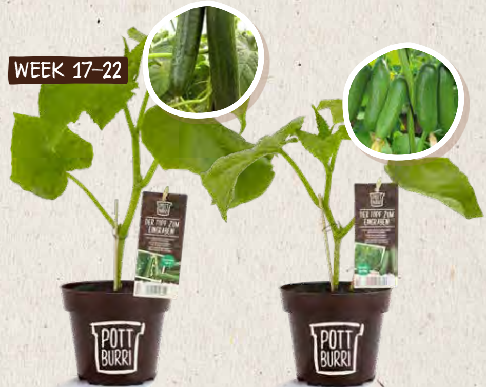
ORGANIC SNAKE CUCUMBER „LUCKY CUCUMBER“