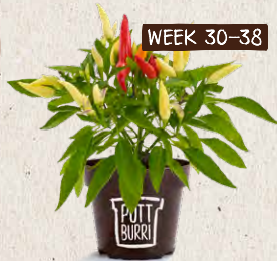
ORGANIC CHILI MILD / HOT / EXTRA HOT