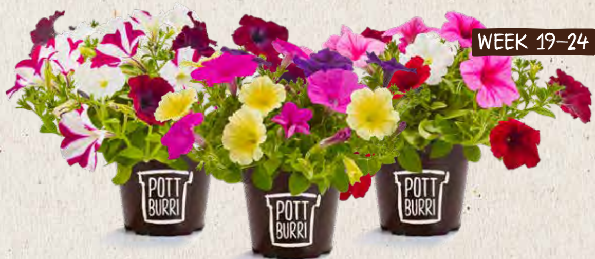
PETUNIA „WAVE TRIO“