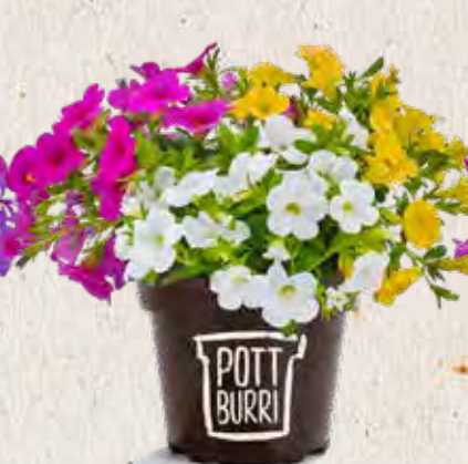
CALIBRACHOA TRIO „BRASIL“