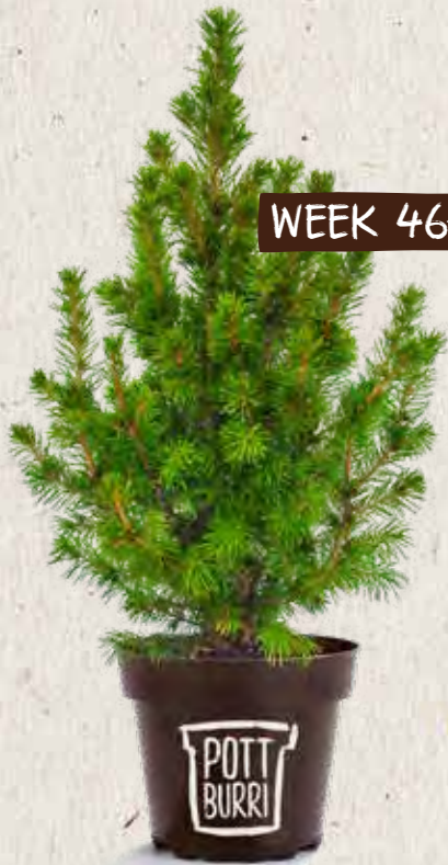
MINI FIR TREE