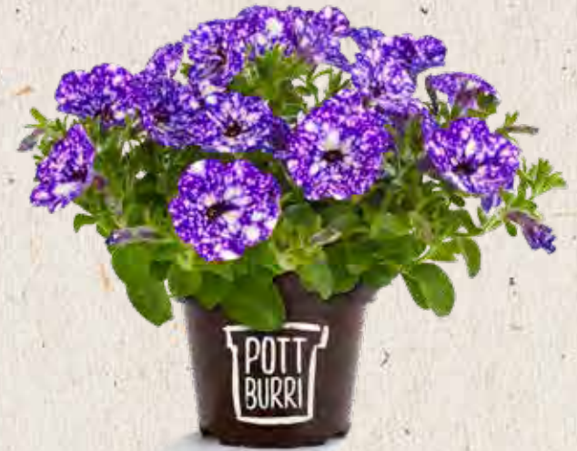
PETUNIA „NIGHT SKY“