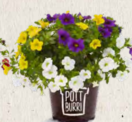
CALIBRACHOA TRIO „VENEDIG“