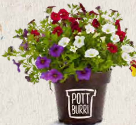
CALIBRACHOA TRIO „CAFE DE PARIS“