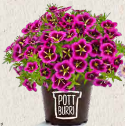
CALIBRACHOA „GOOD NIGHT KISS“