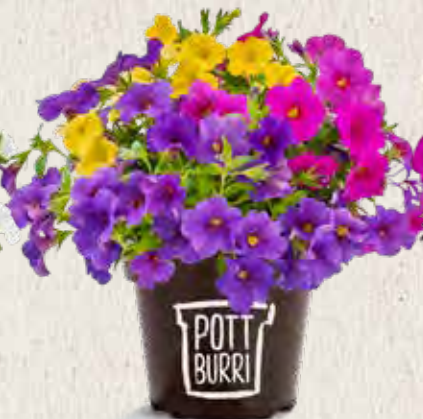
CALIBRACHOA TRIO „TROPICANA“