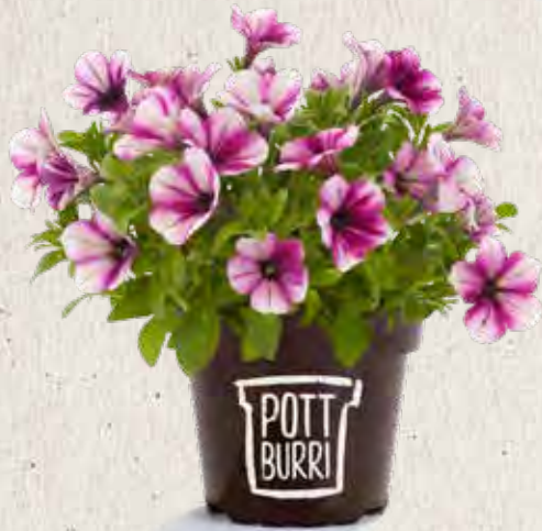
PETUNIA „PURPLE TOUCH“