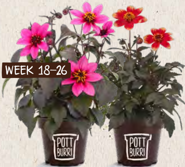
DAHLIAS „HAPPY DAYS“