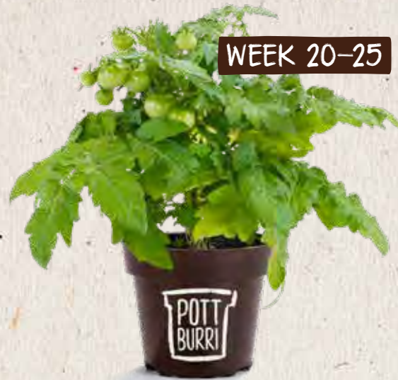
BALCONY TOMATO „PRIMABELL“