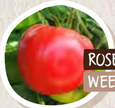
ROSE CRUSH WEEK 15-23