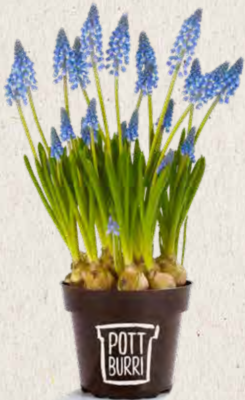
PREMIUM MUSCARI „BLUE SMILE“