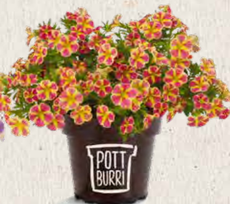
CALIBRACHOA „CANDY BOUQUET“