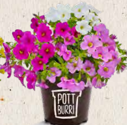
CALIBRACHOA TRIO „PINK PARADISE“