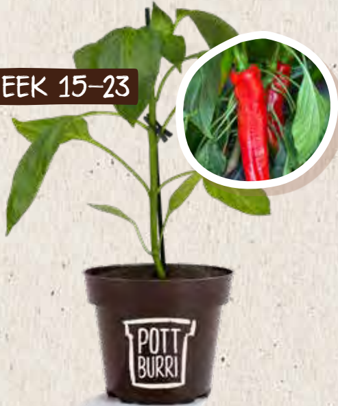
ORGANIC SWEET PEPPER „CONORED“