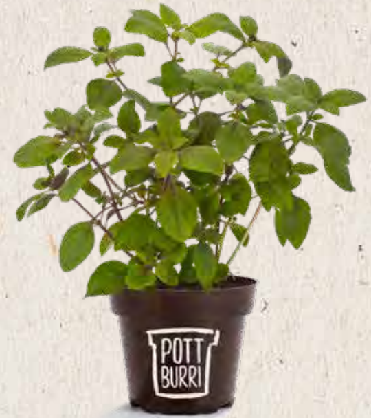
ORGANIC SHRUB BASIL