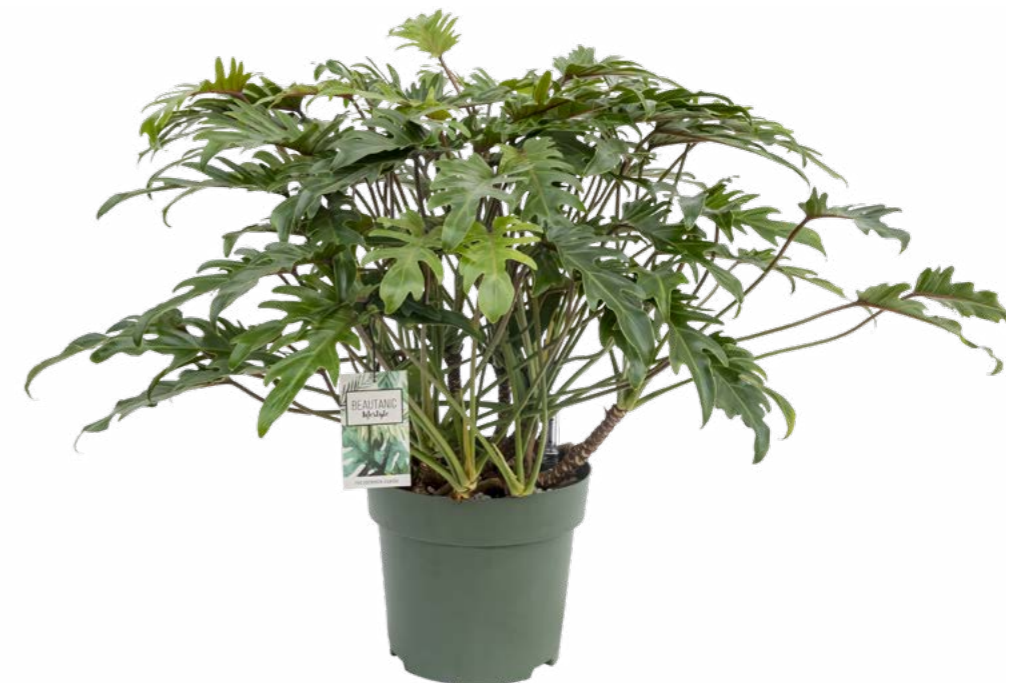
Philodendron Xanadu Pot size 30cm