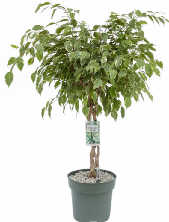
Ficus Safrana Pot size 27cm