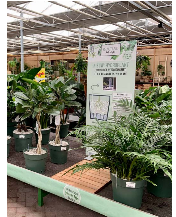
2. Banner in garden center