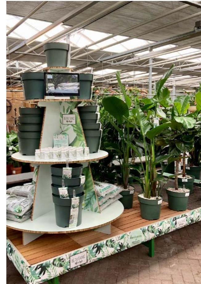
1. Furniture with display in garden center