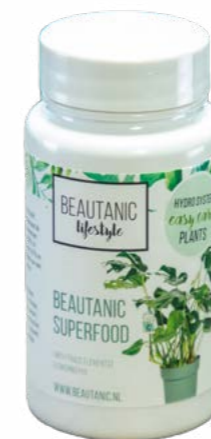
10. Beautanic Superfood 100 ml