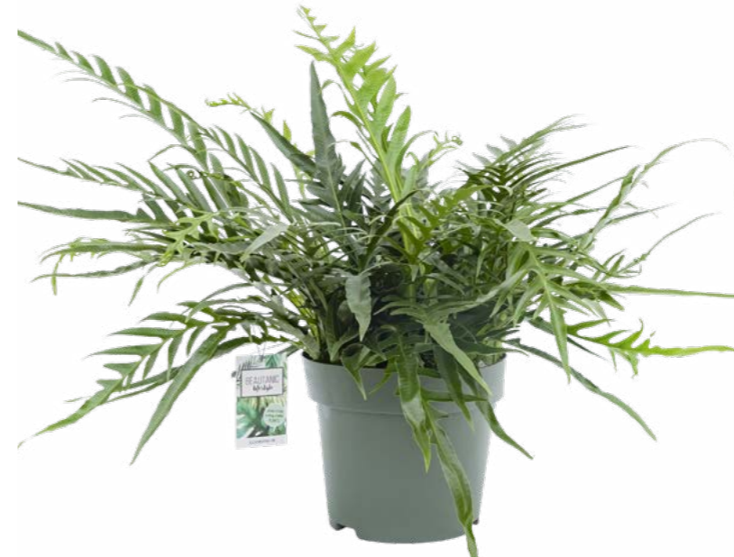
Aglaomorpha Jim Pot size 30cm