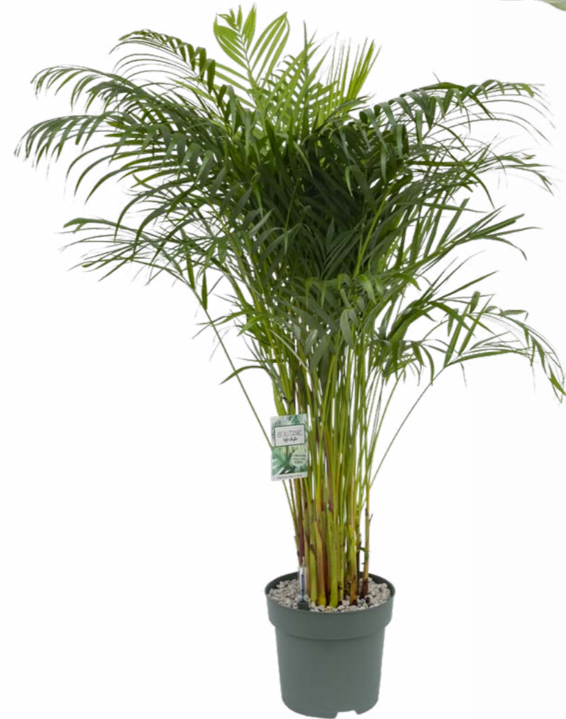
Areca Butterfly Palm Pot size 27cm