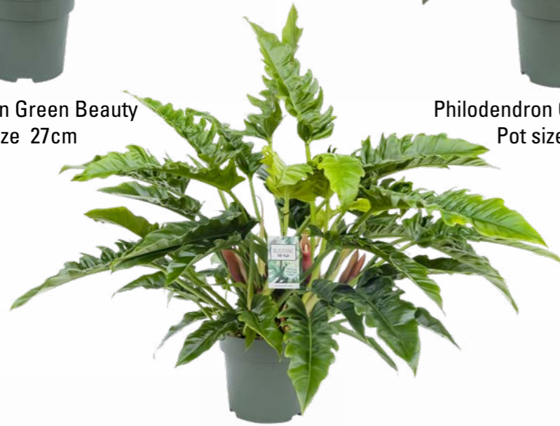
Philodendron Rambo Pot size 27cm