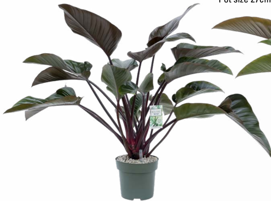
Philodendron Red Beauty Pot size 27cm