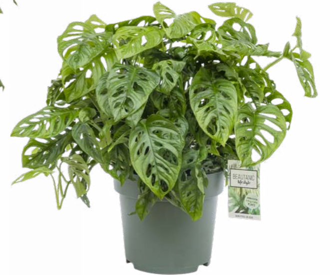
Monstera Adansonii Pot size 27cm