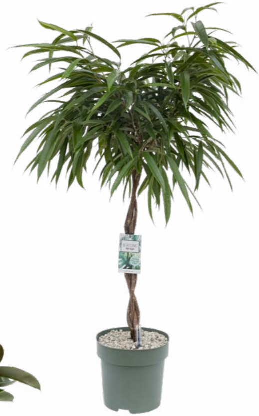
Ficus Mahori Pot size 27cm