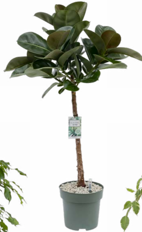
Ficus Makana Pot size 27cm