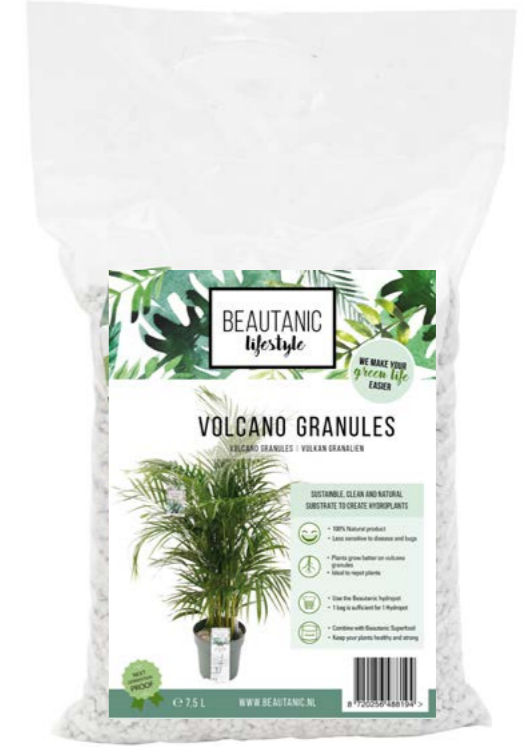
8. Volcanic grains