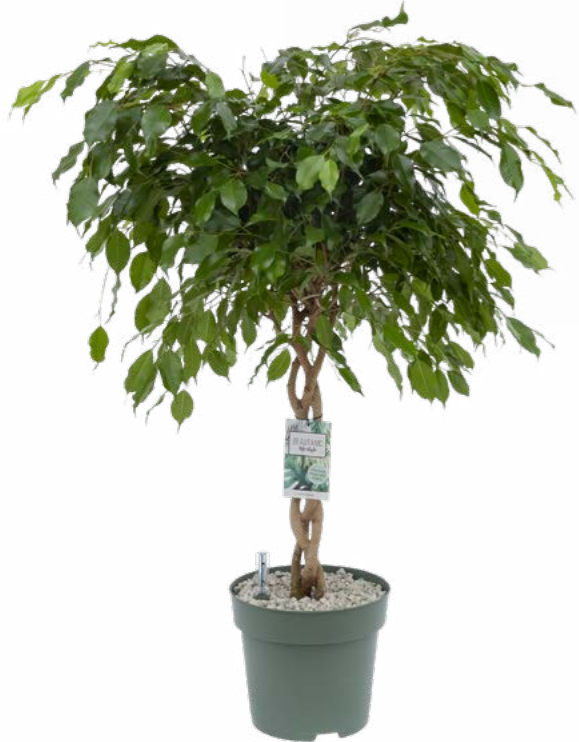
Ficus Adora Pot size 27cm