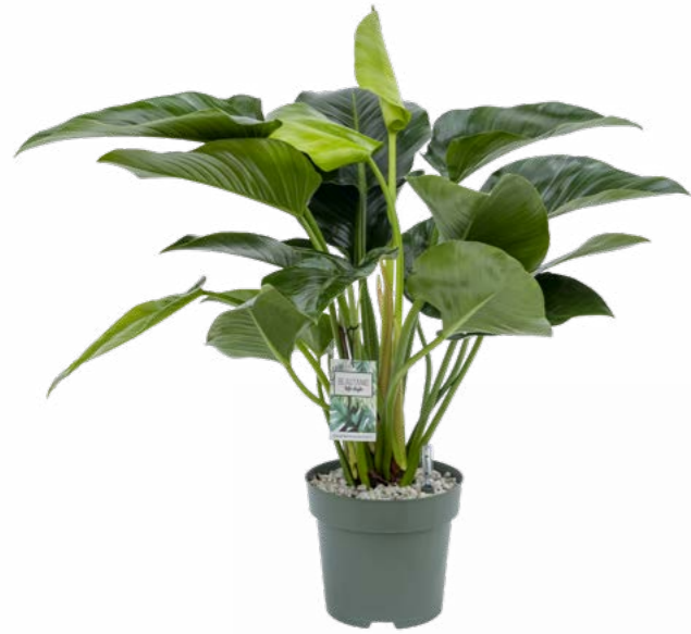
Philodendron Green Beauty Pot size 27cm