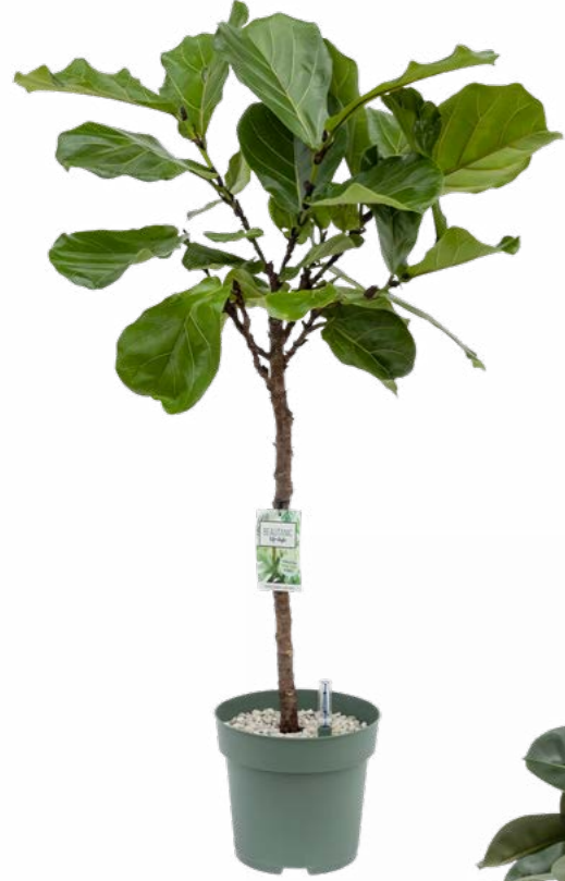
Ficus Lyrata Pot size 27cm