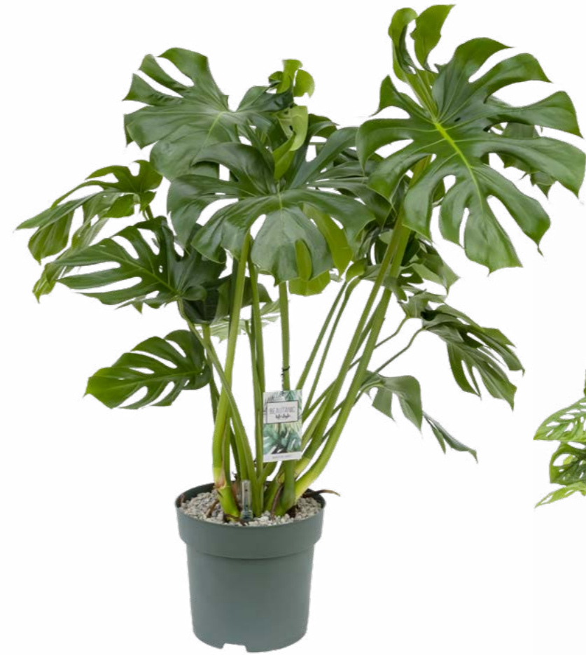
Monstera Deliciosa Pot size 30cm