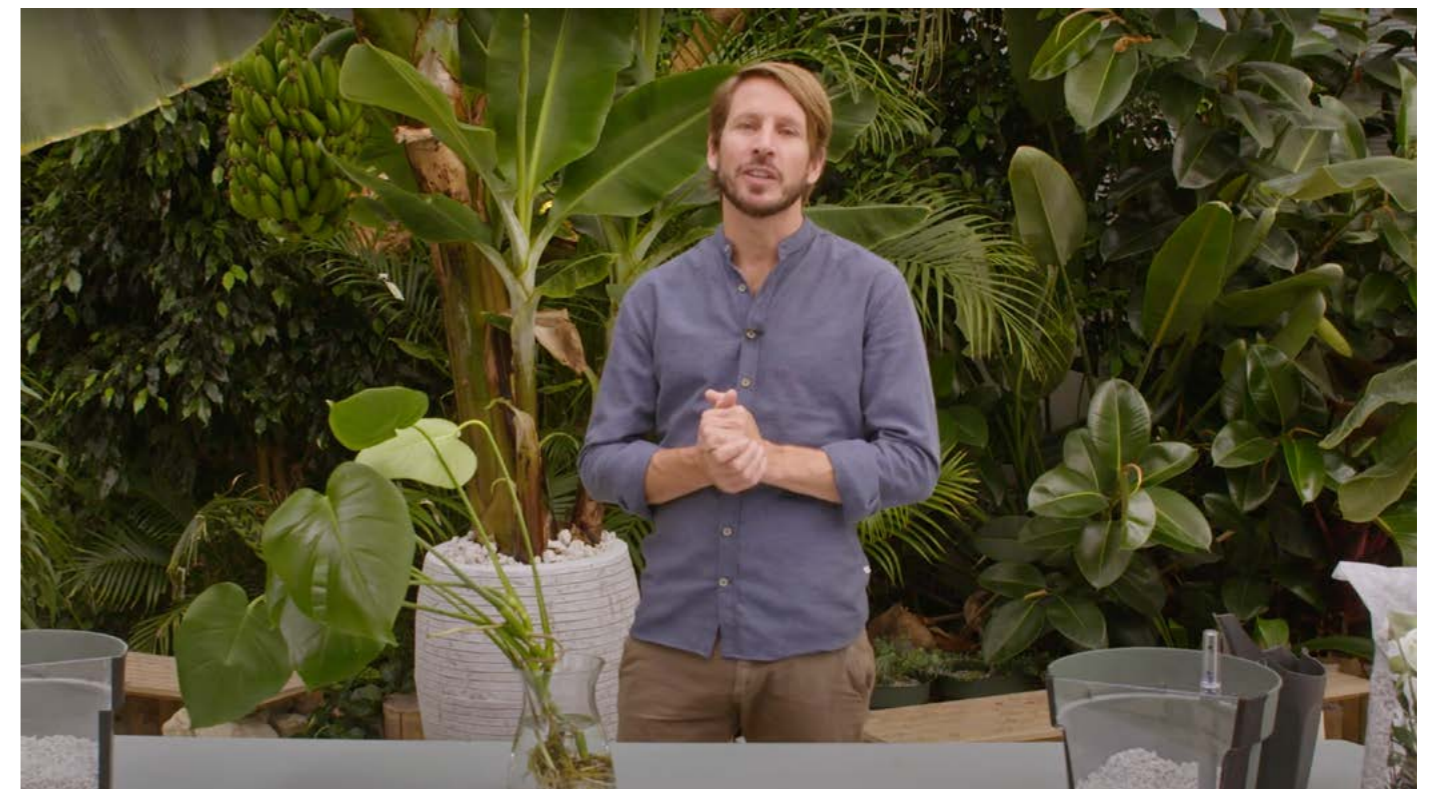
3. Video about Beautanic Lifestyle