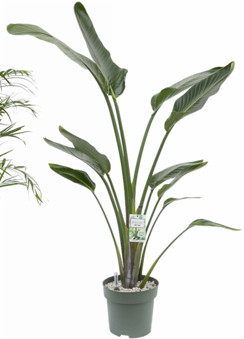
Strelitzia Nicolai Pot size 27cm