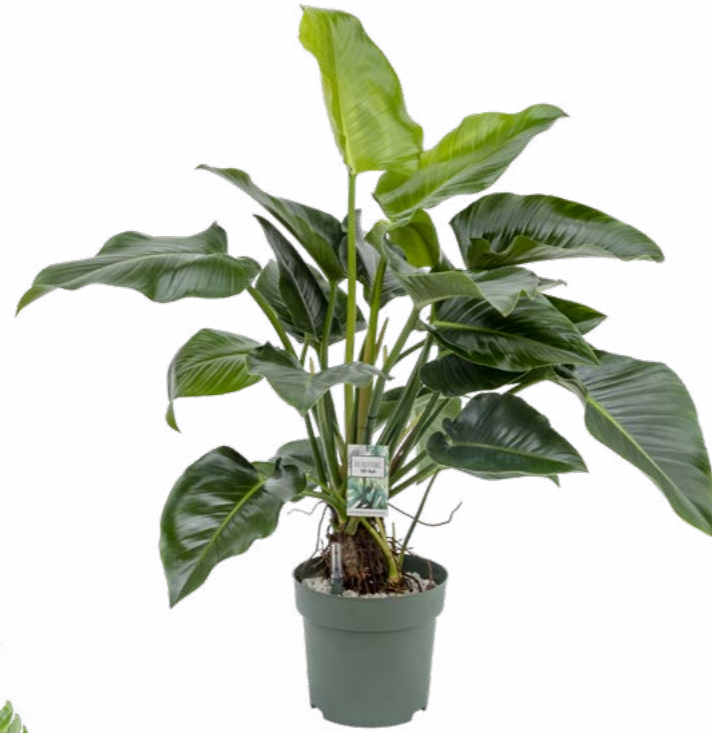
Philodendron Green Beauty Pot size 30cm