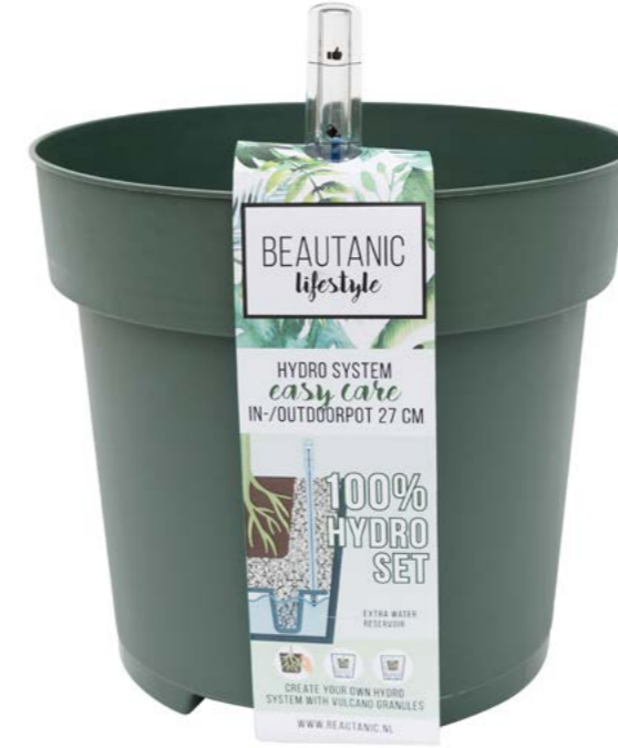
7. Hydropot with water meter and water tank