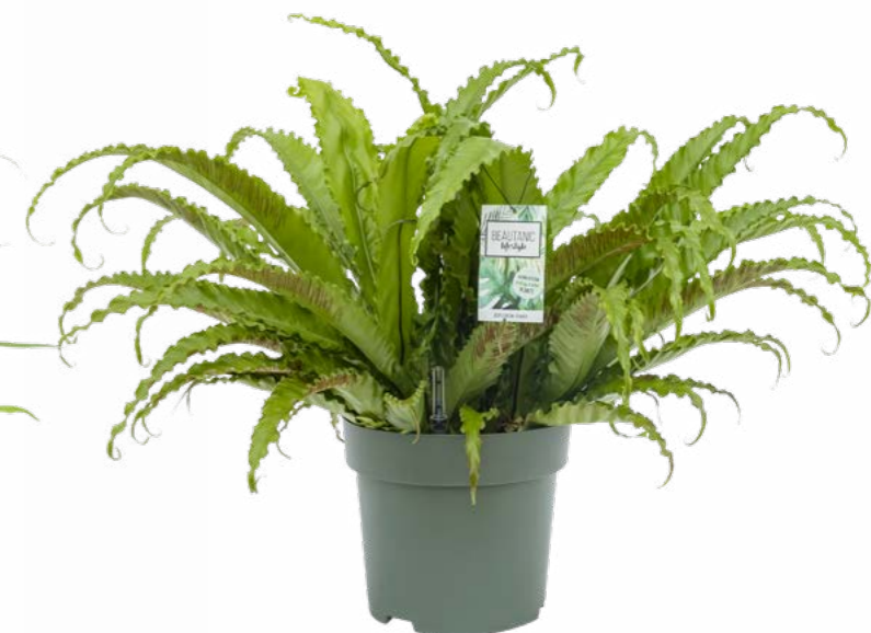
Asplenium Osaka Pot size 30cm