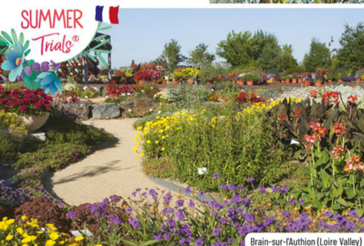
Brain-sur-l'Authion (Loire Valley)