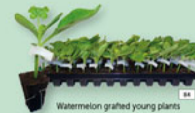
Watermelon grafted young plants