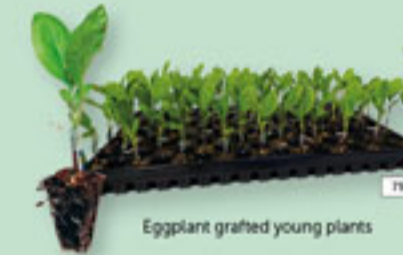
Eggplant grafted young plants