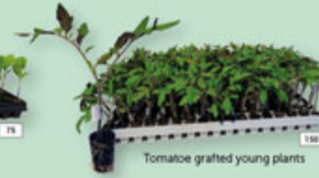
Tomato grafted young plants