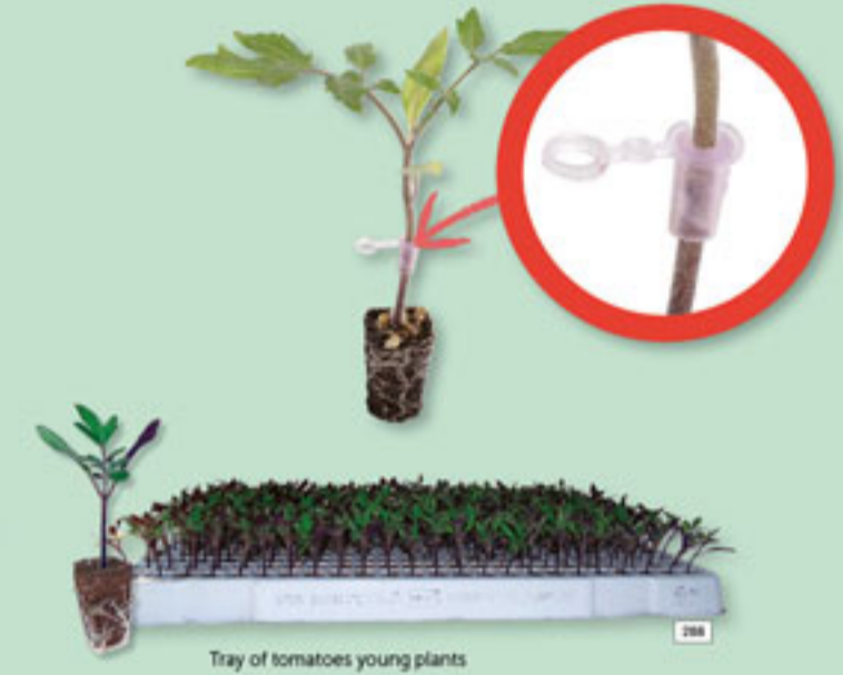
Tray of tomatoes young plants