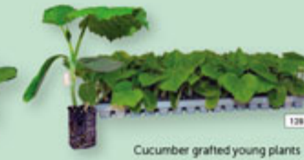
Cucumber grafted young plants