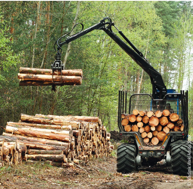
Forest Climate Fund: Support to adapt forests to climate change

The “Energy and Climate Fund” supports the Federal Government's energy and climate policy goals. As a component of the Energy and Climate Fund, the “Forest Climate Fund” was initiated jointly by the Federal Ministry of Food and Agriculture (BMEL) and the Federal Ministry of Environment (BMU) in 2013. Measures under the Forest Climate Fund will help to tap the potential of forest and wood for CO 2 reduction and to support the adaptation of German forests to climate change. The Forest Climate Fund is managed by the FNR.