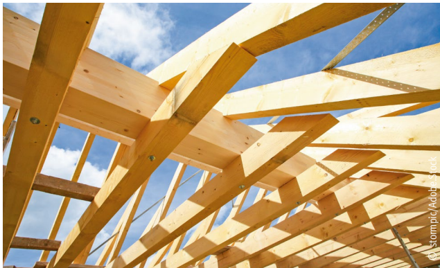
Building with timber protects the climate.