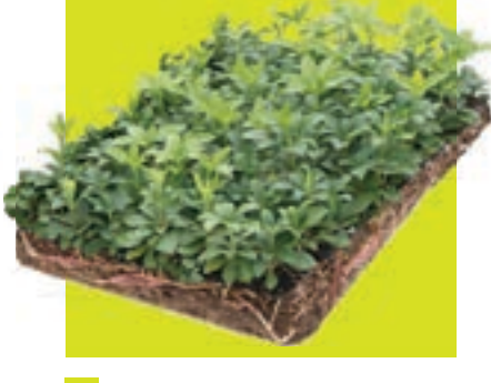
9 Covergreen® Pachysandra H 15-20 cm Shade Bloom colour: white