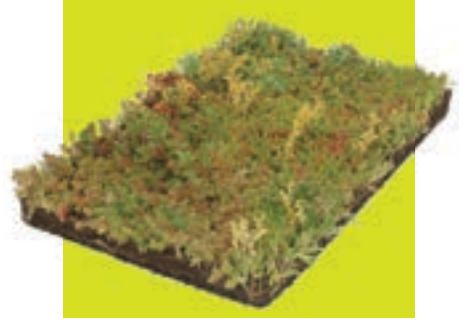
6 Covergreen® Sedum H 2-7 cm Sun Highly suited to roof planting