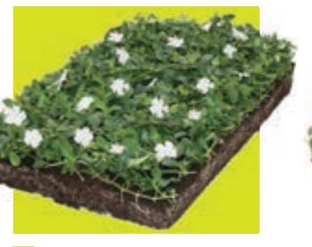
2 Covergreen® Vinca minor gertrude jekyll H 10-20 cm Half shade/Half sun Bloom colour: white