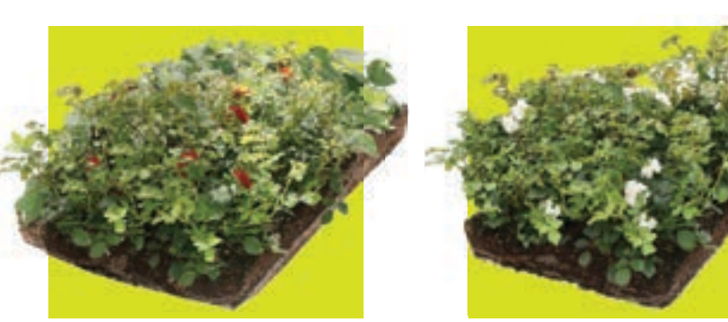
7 Covergreen® Rosa Robin H 20-40 cm Sun Bloom colour: red