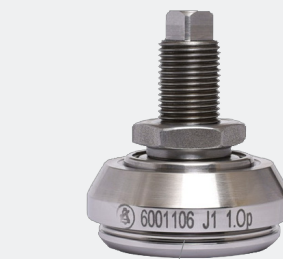
Grinded and polished profile