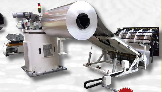
MATERIAL CONTROL STAND