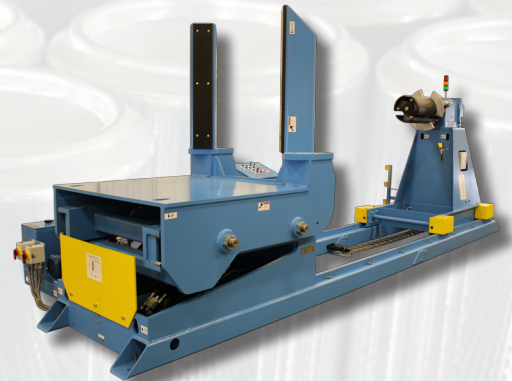
UNITIZED SHELL PRESS SYSTEM