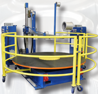
VERTICAL TAB UNCOILER