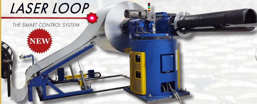
SINGLE & DOUBLE ARM UNCOILER