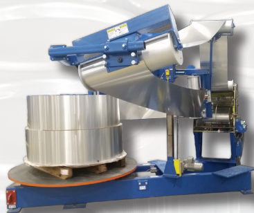
VERTICAL SHELL UNCOILER