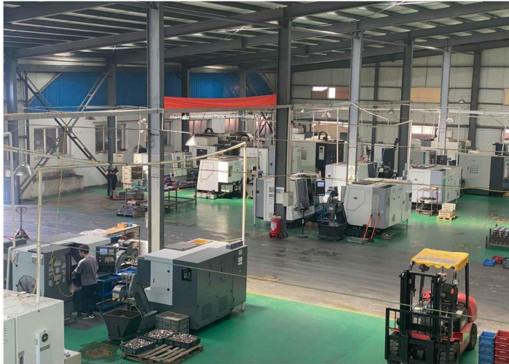
Shenyang XinJin Auto Parts Manufacturing Co., Ltd.