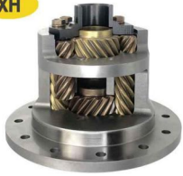
L.S.D NON PRELOAD