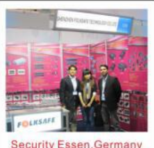
Security Essen, Germany