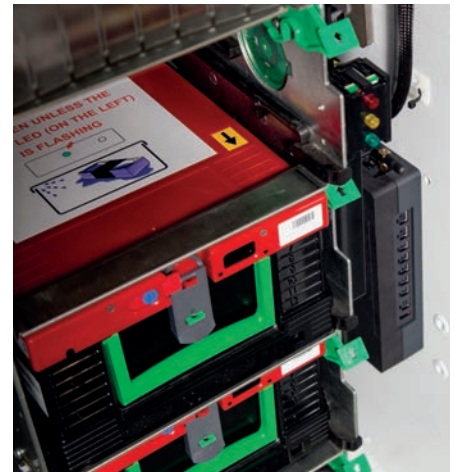
↑ Two-way encrypted radio communication with the hub+ continuously monitors and reports the status of the a2m active .