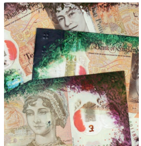
↑ Sensors detect an attack and automatically release the permanent ink stain. Add CRIMETAG® , our unique forensic tracing technology.