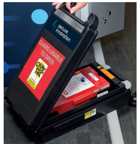
↑ a2m active can be transported in an ibox cassette across the pavement for increased security.