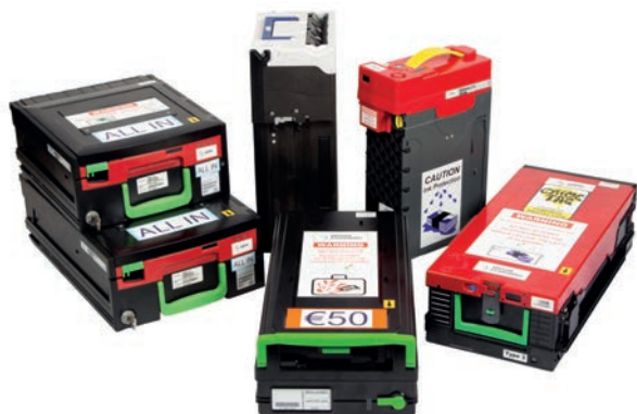
↑ a2m active range from Secure Innovation

Protect cash in your ATM network; whether it is transported, replenished, or stored.