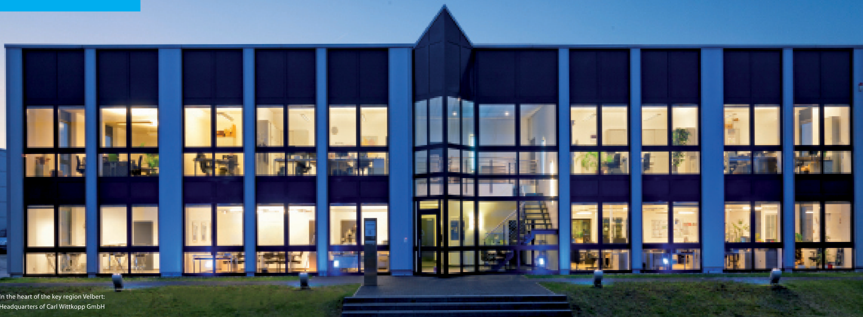
In the heart of the key region Velbert: Headquarters of Carl Wittkopp GmbH