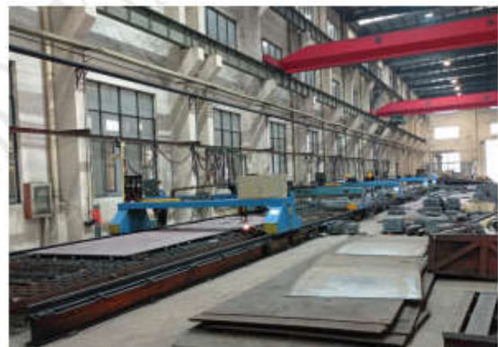
CNC Steel Plate Cutting Center