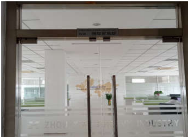
International Trade Department