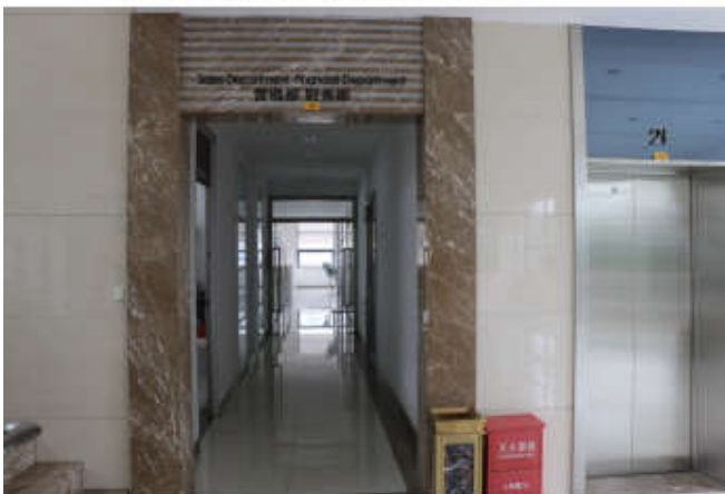
Domestic Sales Department