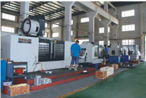
CNC molybdenum wire cutting center