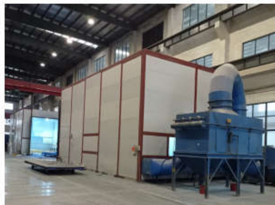
Full Automatic Painting Center