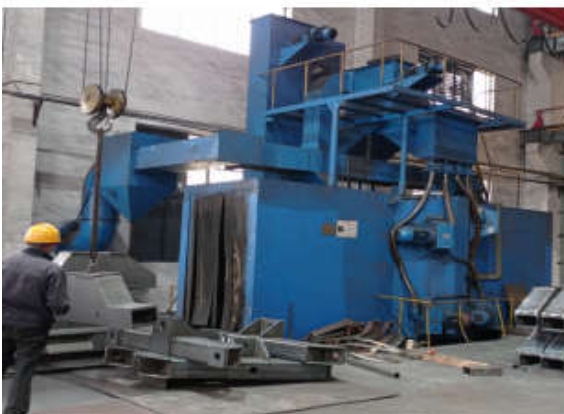
Shot Blasting Machine for Cleaning Surface