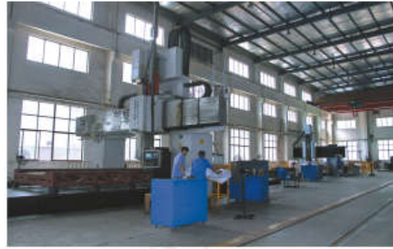
5-axis CNC machining center