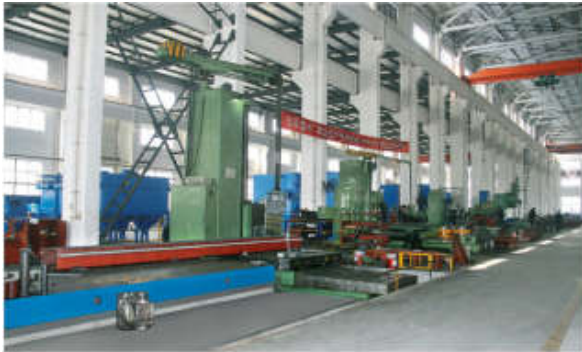
Precision Boring and Milling Machine

We have many high-precision, high efficiency machining center equipped with rail grinding, precision horizontal machining,flexible machining workshop,Hecket horizontal machining and other large scale professional processing equipment and advanced testing center,which are applied through the product production line.Only fine and advanced production equipment can produce sophisticated products.