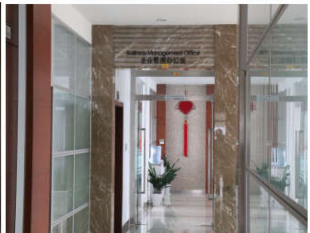
Business Management Office