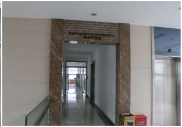
Technology Development Department