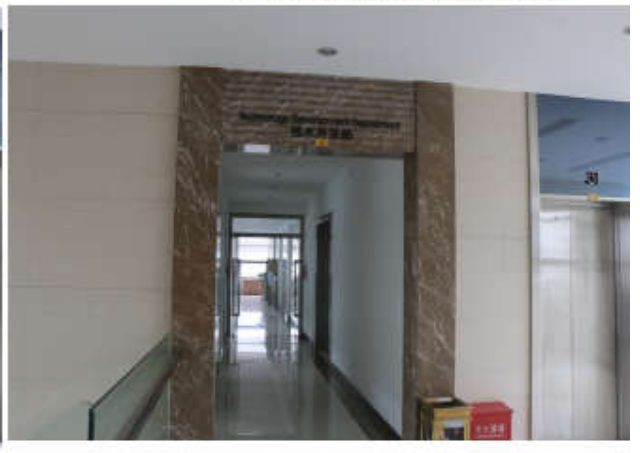
Technology Development Department