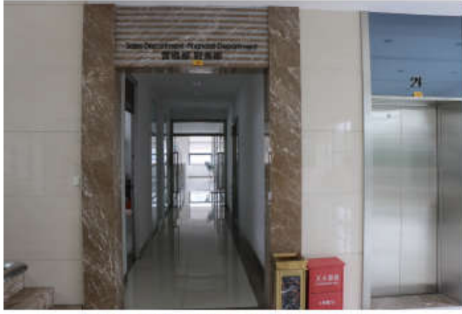
Domestic Sales Department