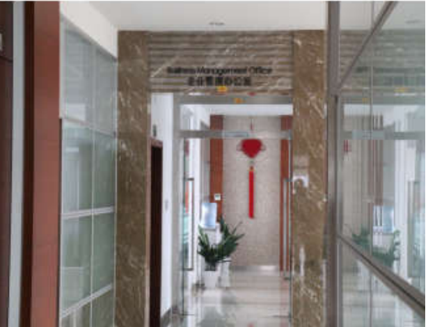
Business Management Office