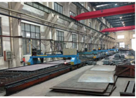
CNC Steel Plate Cutting Center