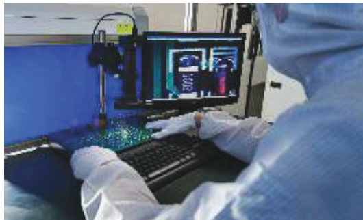
PCB Optical Scanning Inspection