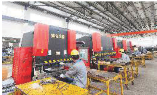
Steel Fabrication for Case Production