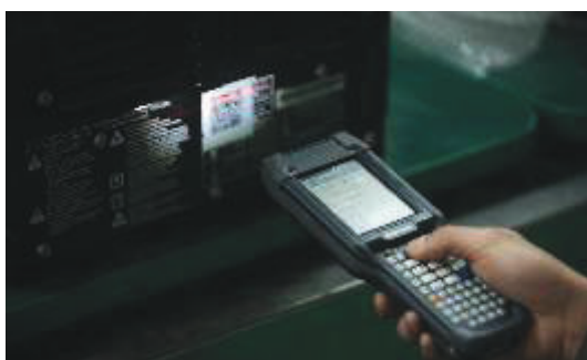
Barcode Tracking System