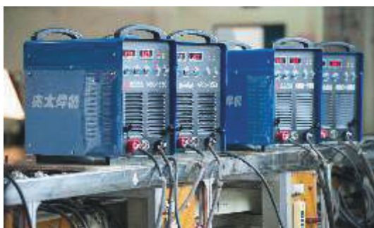
Full Loading Test