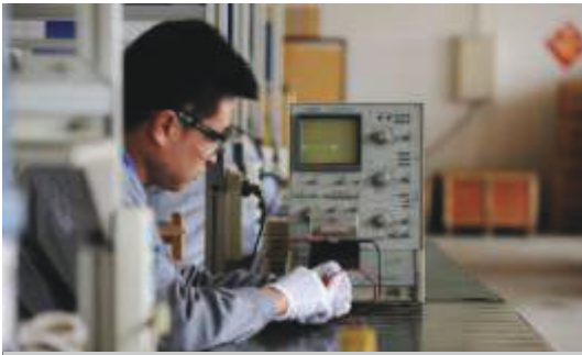
Incoming Material Inspection