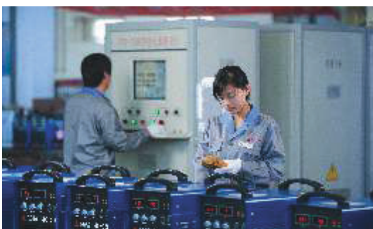
Calibration and Debugging Procedure