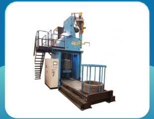
No Twist Coiler Take-Up