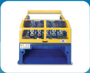
Forming & Reduction Mills