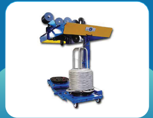
Single & Multiwire Payoffs & Take-Ups