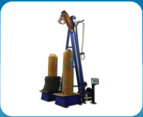
Rod & Wire Payout Systems

YOUR FULL - SERVICE WIRE MACHINERY SUPPLIER