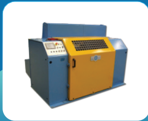
Spooling & Coiling Concepts